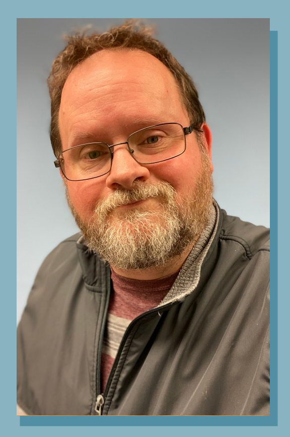
Chief of Creative Oversight Director, The Volunteer Channel (TVC)